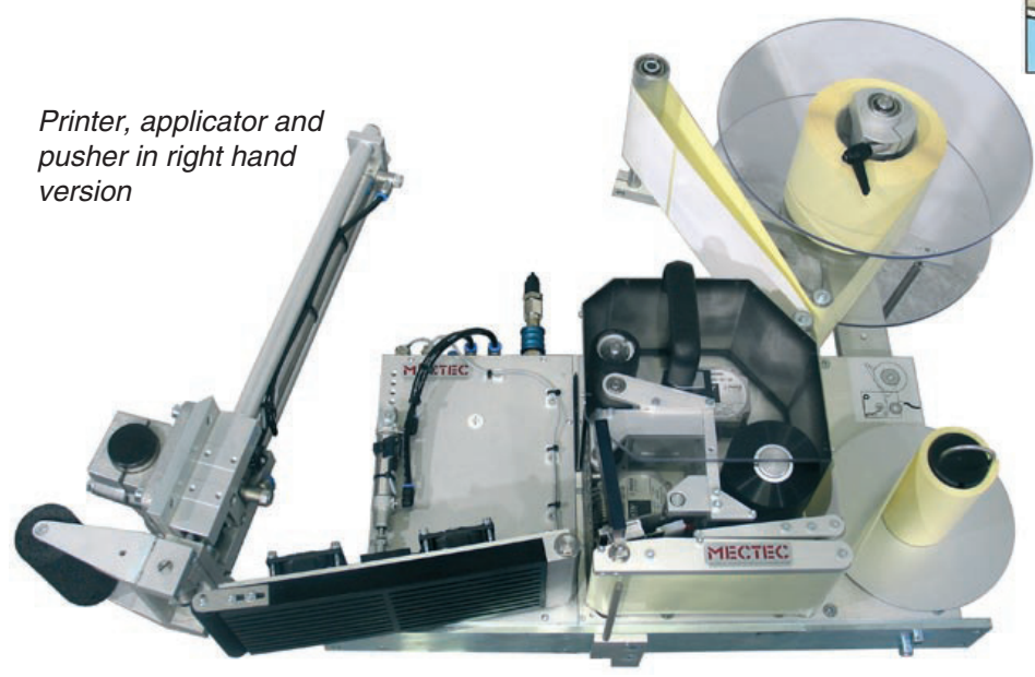
Printer, applicator and pusher in right hand version