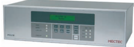
Printer Control Unit PCU III