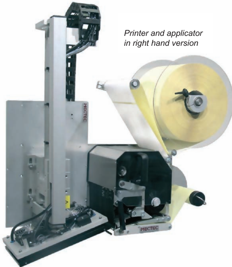
Printer and applicator in right hand version

With TT200 you have the ideal solution for large box or single side pallet labelling. The TT200 has the reliable, robust and easy to use design - as seen on all the Mectec family machines. It is proven to give you 24 hours reliable labelling for many years to come - even in the most harsh industrial environments!