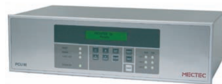
Printer Control Unit PCU III