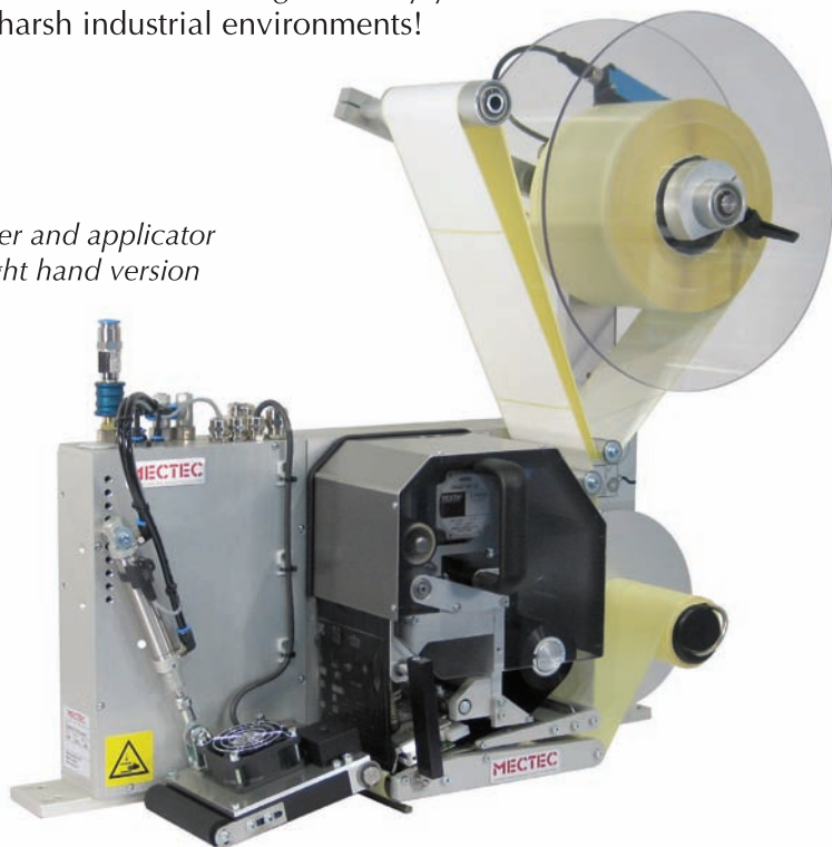
Printer and applicator in right hand version

The TW100 has the reliable, robust and easy to use design - as seen on all the Mectec family machines. It is proven to give you 24 hours reliable labelling for many years to come - even in the most harsh industrial environments!