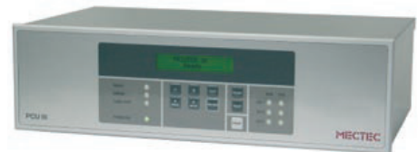
Printer Control Unit PCU III.