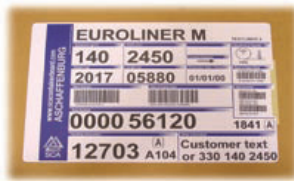
TW300 is ideal for A3 labelling within the Paper industry.