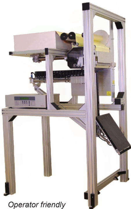
Operator friendly and easy to use design.