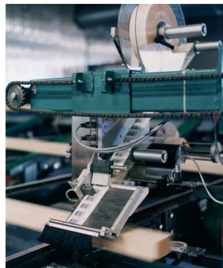
Labelling within wood industry - a rough environment that puts high demands on the equipment.