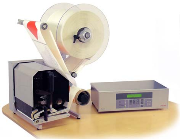
T70 Desktop version together with the internal label rewinder (can also be used as peel-off mode).