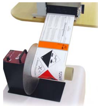
The T70 Desktop version together with an external label rewinder printing labels for chemical industry.