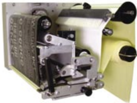
Rugged industrial design. Easy to load labels and ribbon.

T90 is ideal for A3 labelling within the Paper Industry.