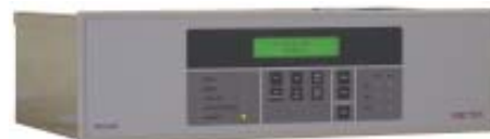
Printer Control Unit PCU III